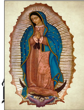
WASHINGTON ARCHDIOCESAN COUNCIL OF CATHOLIC WOMEN

Join us to respond to the needs of the Church and society through a focus on spirituality, leadership, and service.